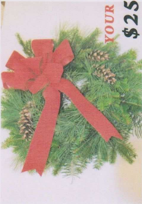
#1 FRESH EVERGREEN WREATH ON 10" RING WITH RED OR MAROON BOW AND PINECONES (18-22")

Sponsored by: Graduation Celebration 2012 ORDERS DUE BY: NOVEMBER 19 th