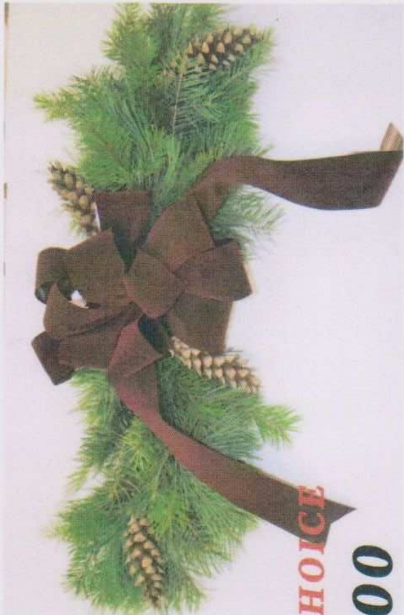
YOUR CHOICE $25.00