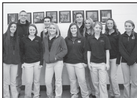
Winter Sports Captains

It is quite apparent that the work ethic here at NDHS is not just shown academically; each team has expressed tremendous dedication to their preparation for the upcoming sports season. Good luck to all Crusader teams this winter. Make us proud!