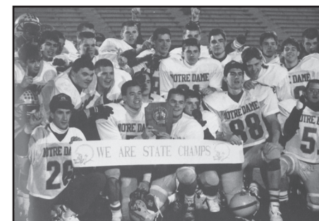
1990 Notre Dame Crusader Football Team

WENY recognized the 1990 Notre Dame Football team as the second greatest football team in the area in the last 25 years. The Crusaders are known for changing the way Elmira area football was viewed that amazing season. The Crusaders won the New York State Title, beating Saugerties